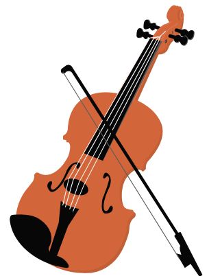
K-2 were lucky enough to have a special violin performance by Evelyn 1/2L at their assembly.