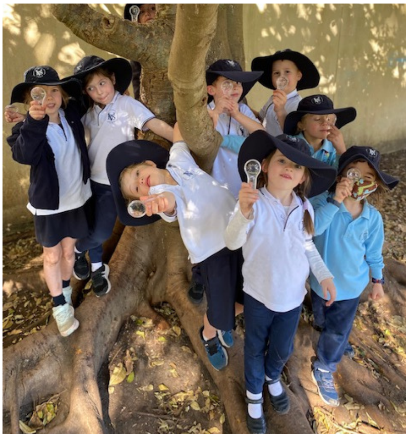
KA used magnifying glasses to explore our playground close up!