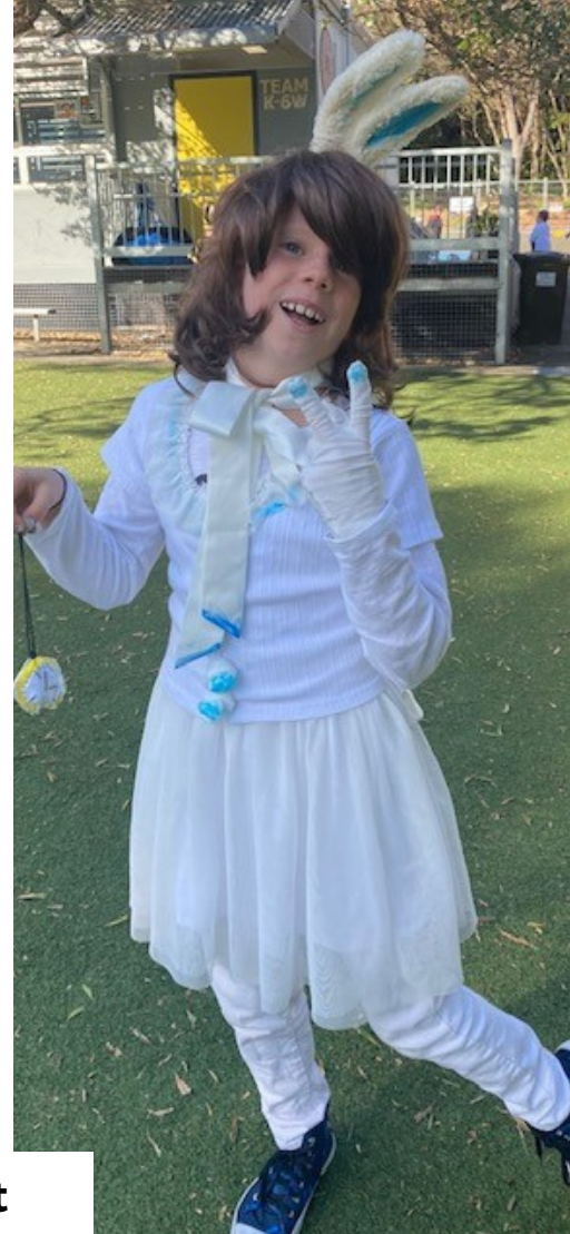
VPS students & teachers put together some amazing costumes for our book week parade!