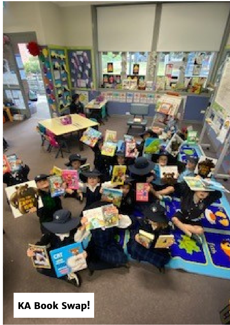
KA Book Swap!