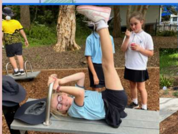
Safe play on the new equipment