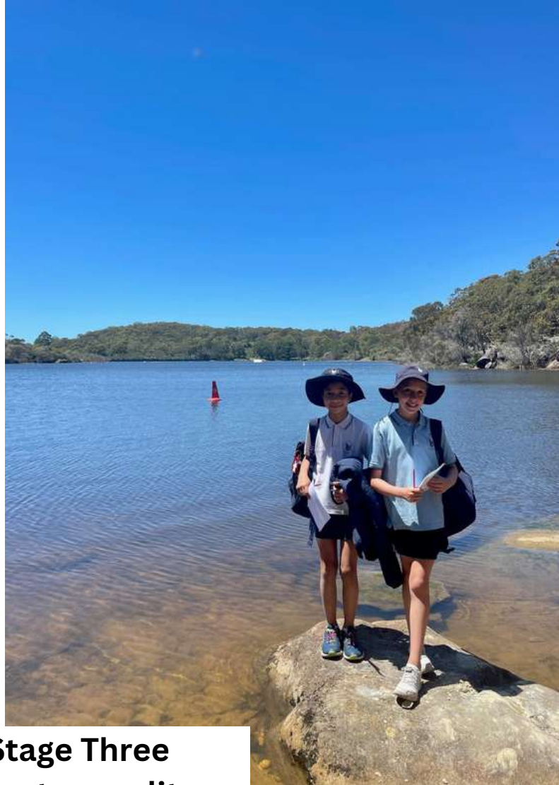
Last week Stage Three undertook a water quality investigation of Manly Dam.