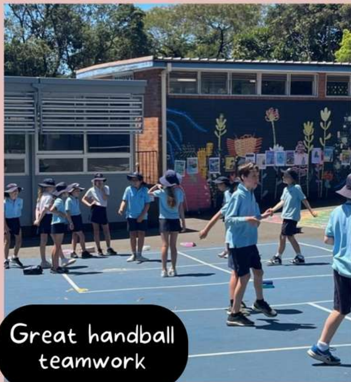
Great handball teamwork