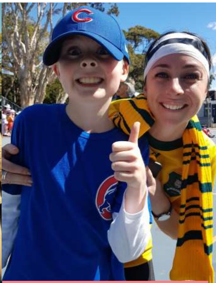
Walkathon Day Today! Our teachers dressed as their favourite sports person