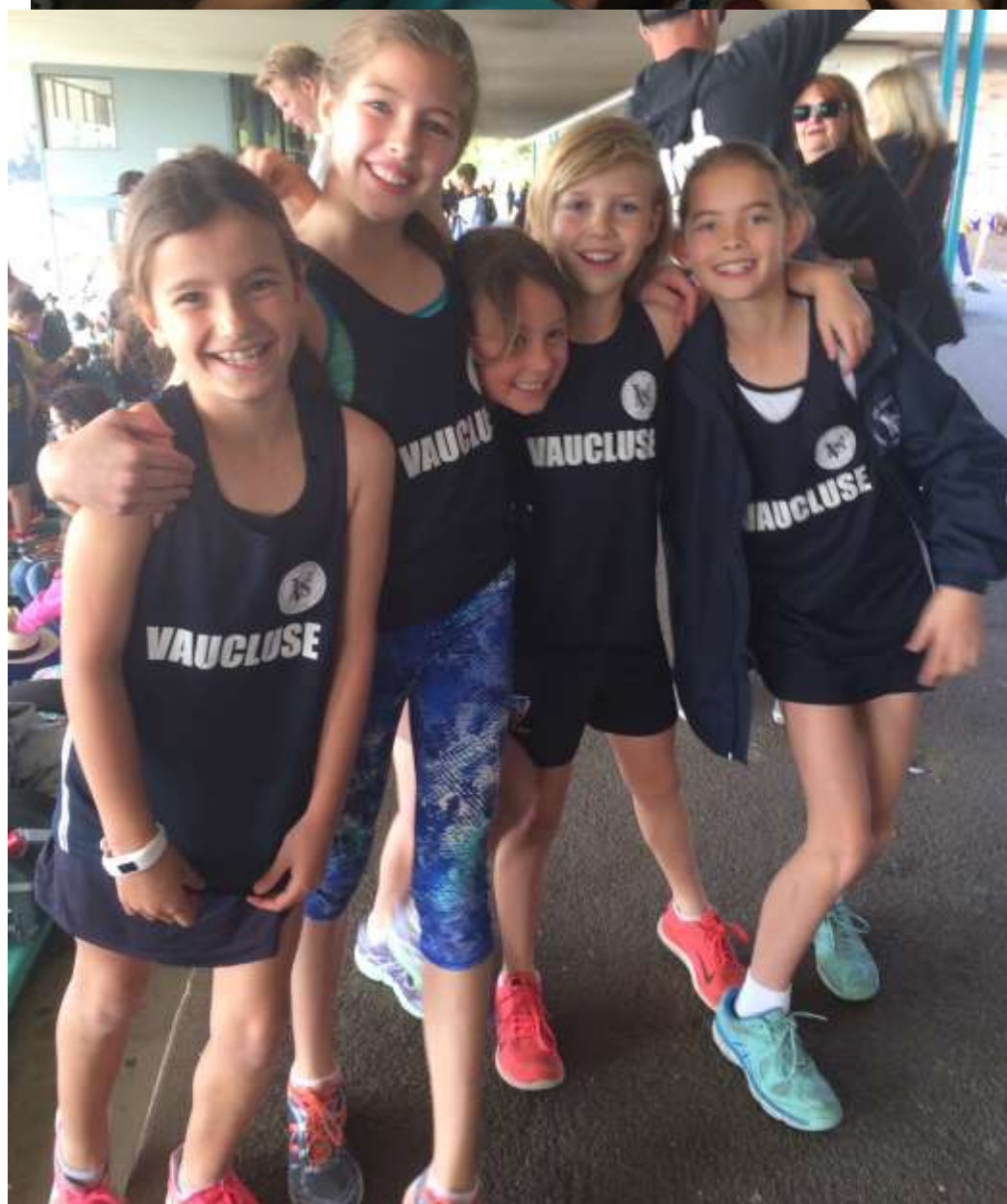
Fun at the Sydney Coastal Districts Athletics Carnival