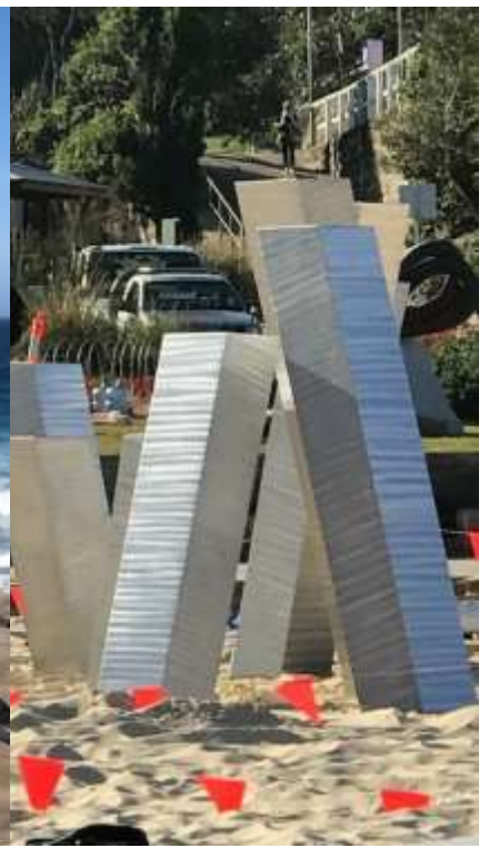
A very special teacher preview of Sculpture By The Sea 2018