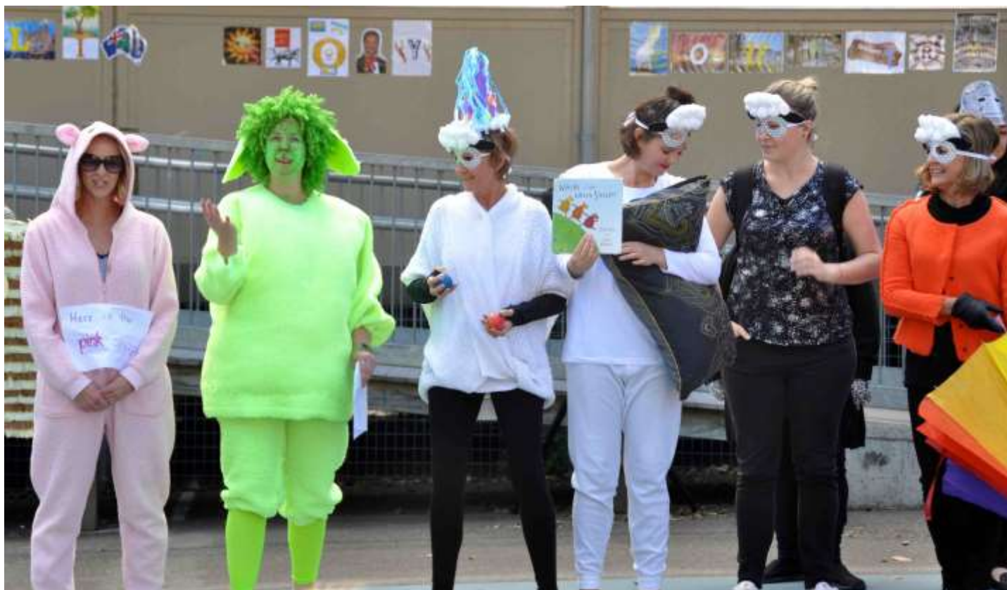
Our very creative and playful teachers at Book Week