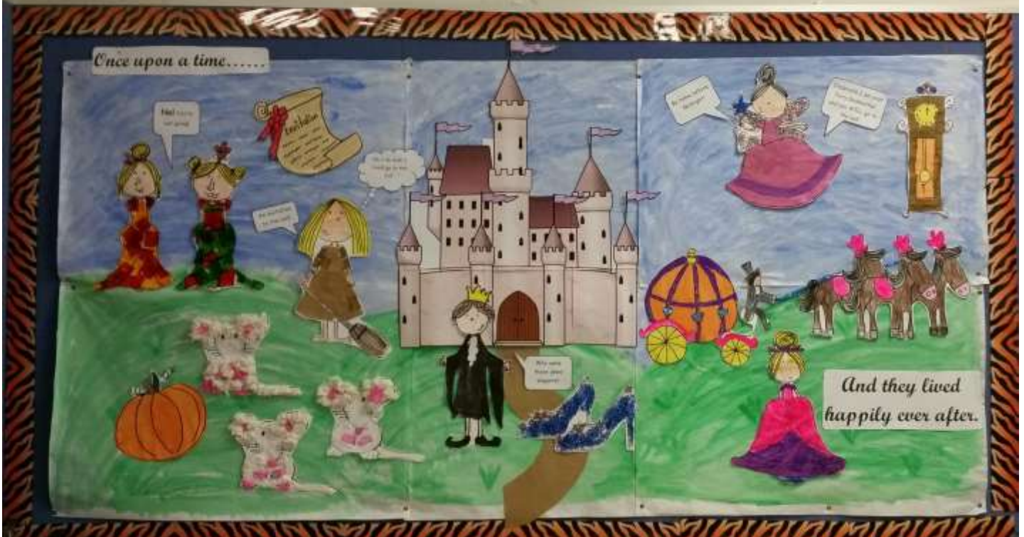
Kindergarten are so proud of their Cinderella Walls