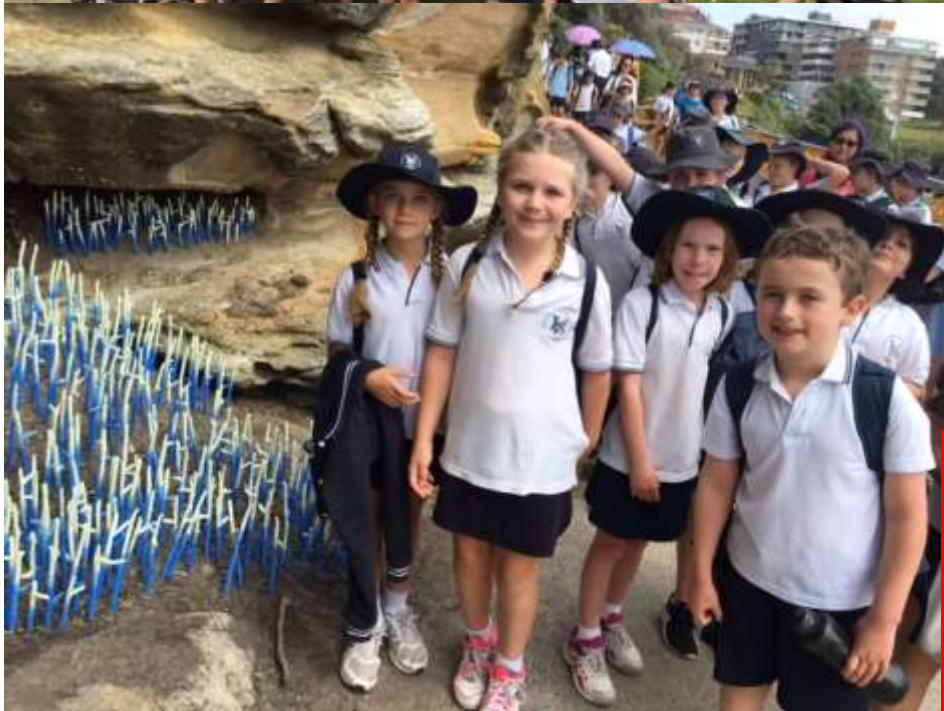
3B at Sculpture by the Sea