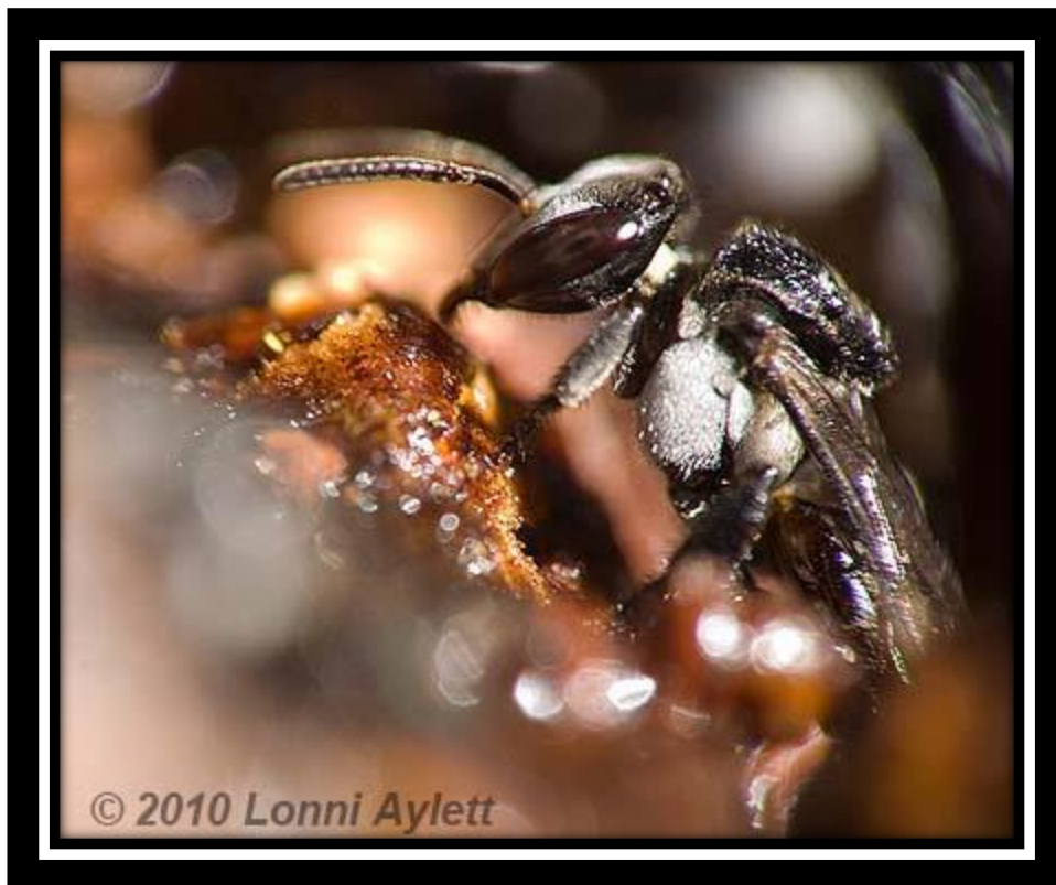
Native bee close up

http://www.aussiebee.com.au/trigona_carbonaria.html