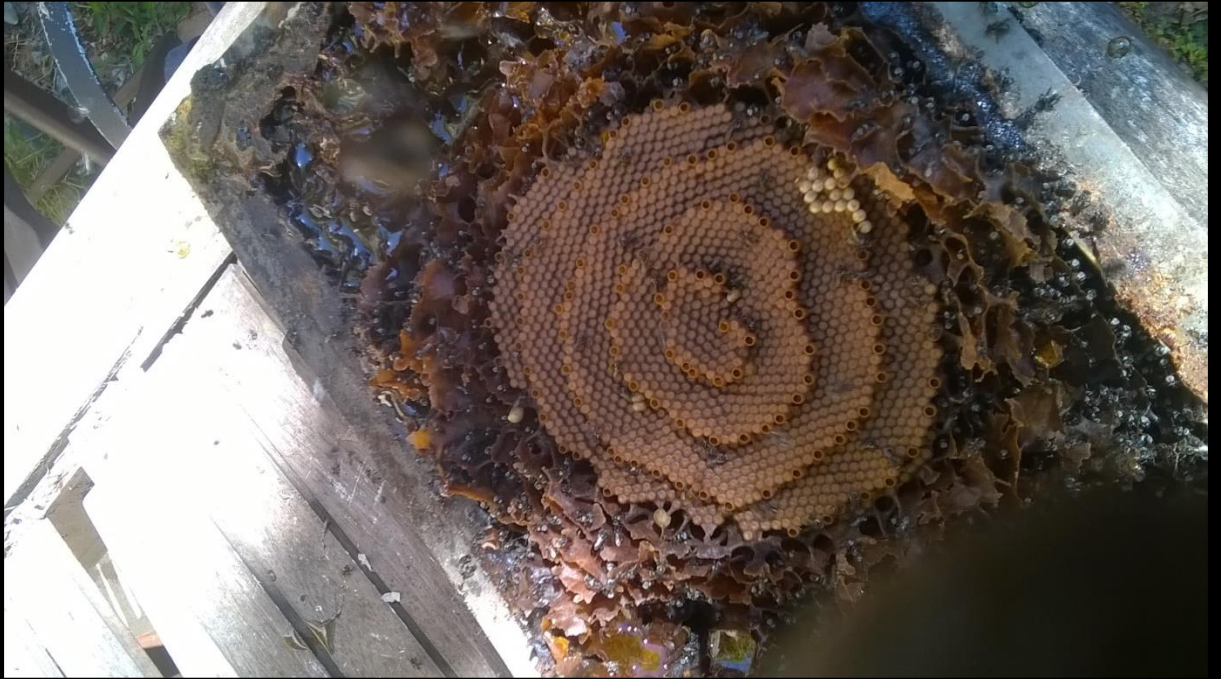
Native Bee hive cut in half