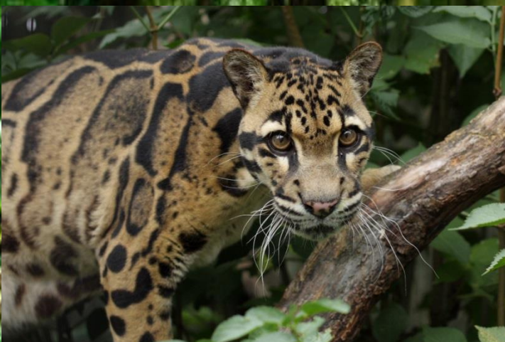
Standing Sunda clouded leopard.