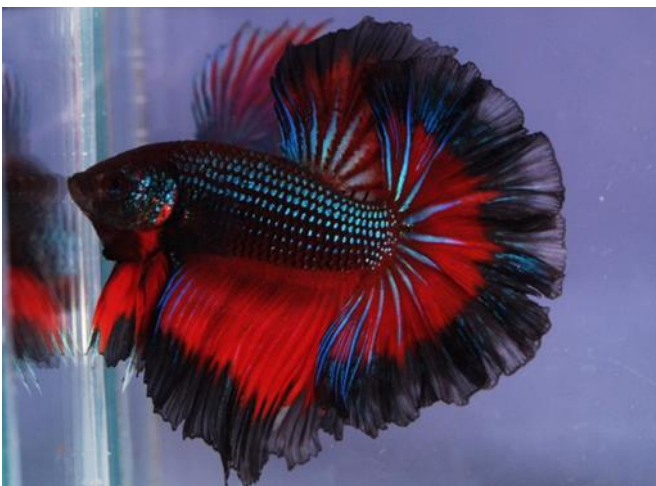
Colourful Siamese fighting fish.

When breeding the Siamese fighting fish curl their bodies together and align their reproductive organs. Then the eggs incubate inside for twenty four to thirty six hours and the male Siamese fighting fish are very protective of the eggs.