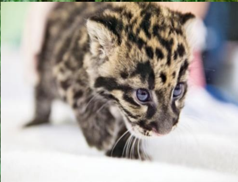
Young clouded leopard.

However, the clouded leopard is a highly endangered species and unless something is done to help these magnificent predators they will soon die out.