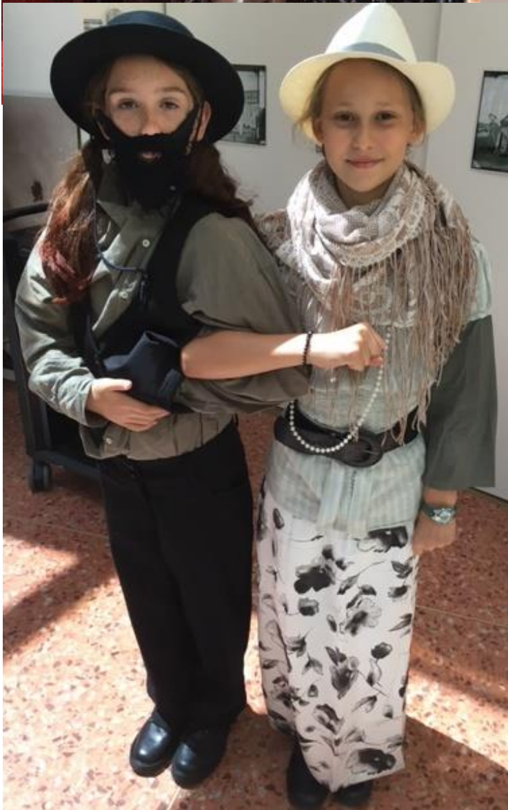
5B and 6T at the NSW Library this week