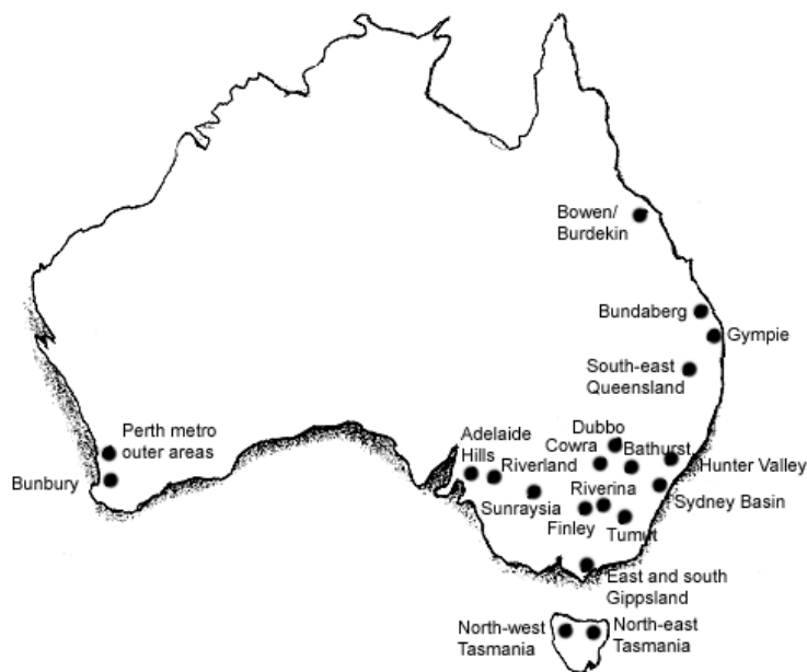
Map of the major sweet corn growing areas in Australia

Sweet corn is grown in most Australian States, with New South Wales producing just over half of the national production. The dominant position of New South Wales and its processing industry is expected to continue.