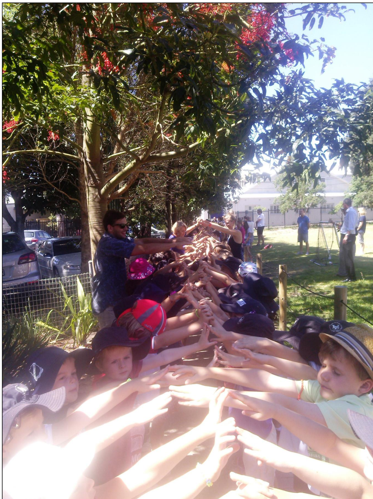
The Tunnel of love. The students and teachers farewell Year 6, as they walk out of Vaocluse Public School for the very last time.