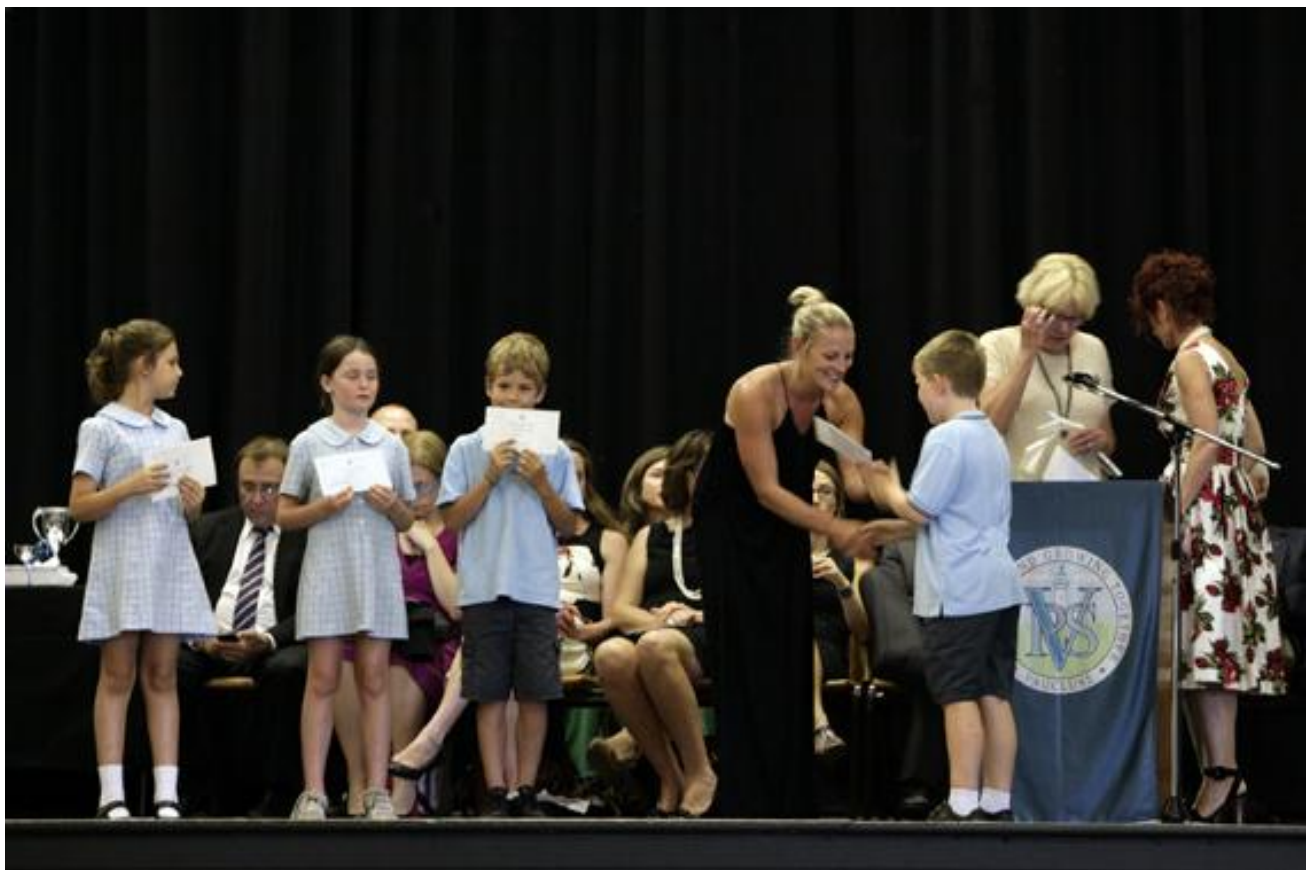
Easily confused as The Academy Awards! Another wonderful Presentation Day last Friday.