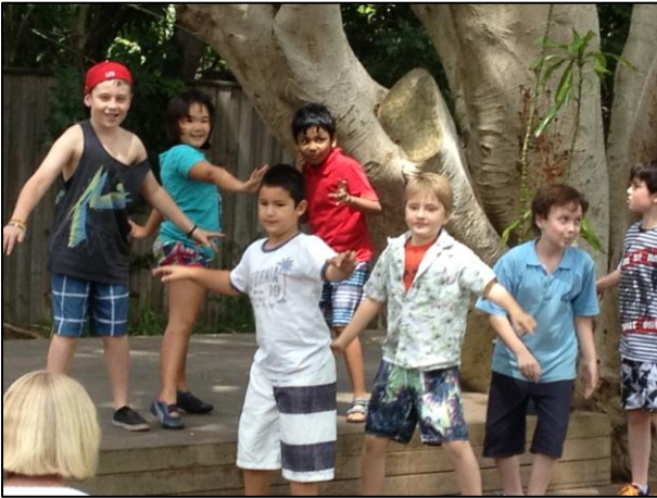
Class Pr perform at the last assembly of 2012