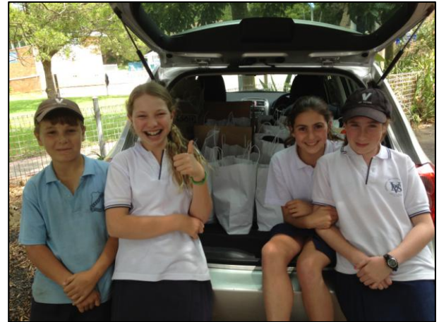
Our wonderful school leaders getting ready to deliver the Care Bags to St Michael's Church.