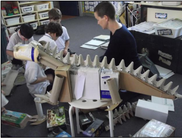
KA busily constructing with their special helpers.