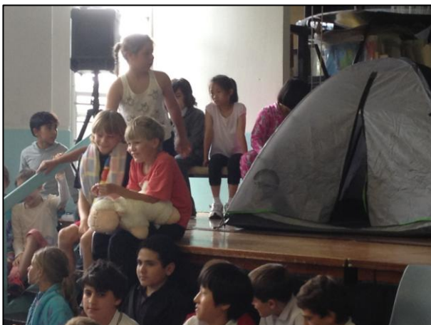
The 4/5A Assembly Item

The Lost Property at Vaucluse Public School is growing at a rapid pace.....please make some time to come and have a rummage!