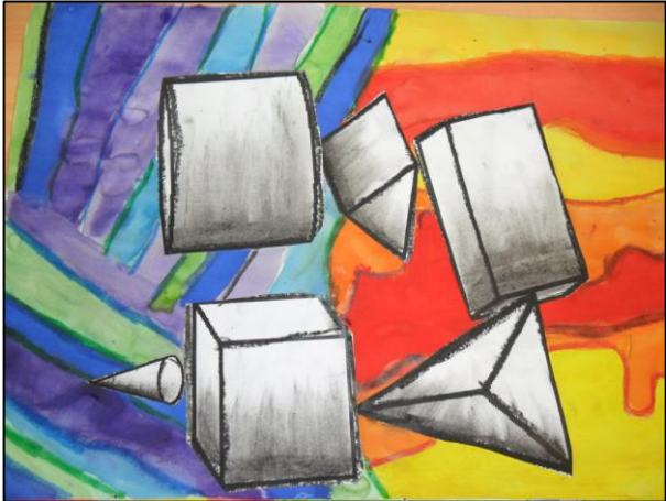
Beautiful Art work from 3A